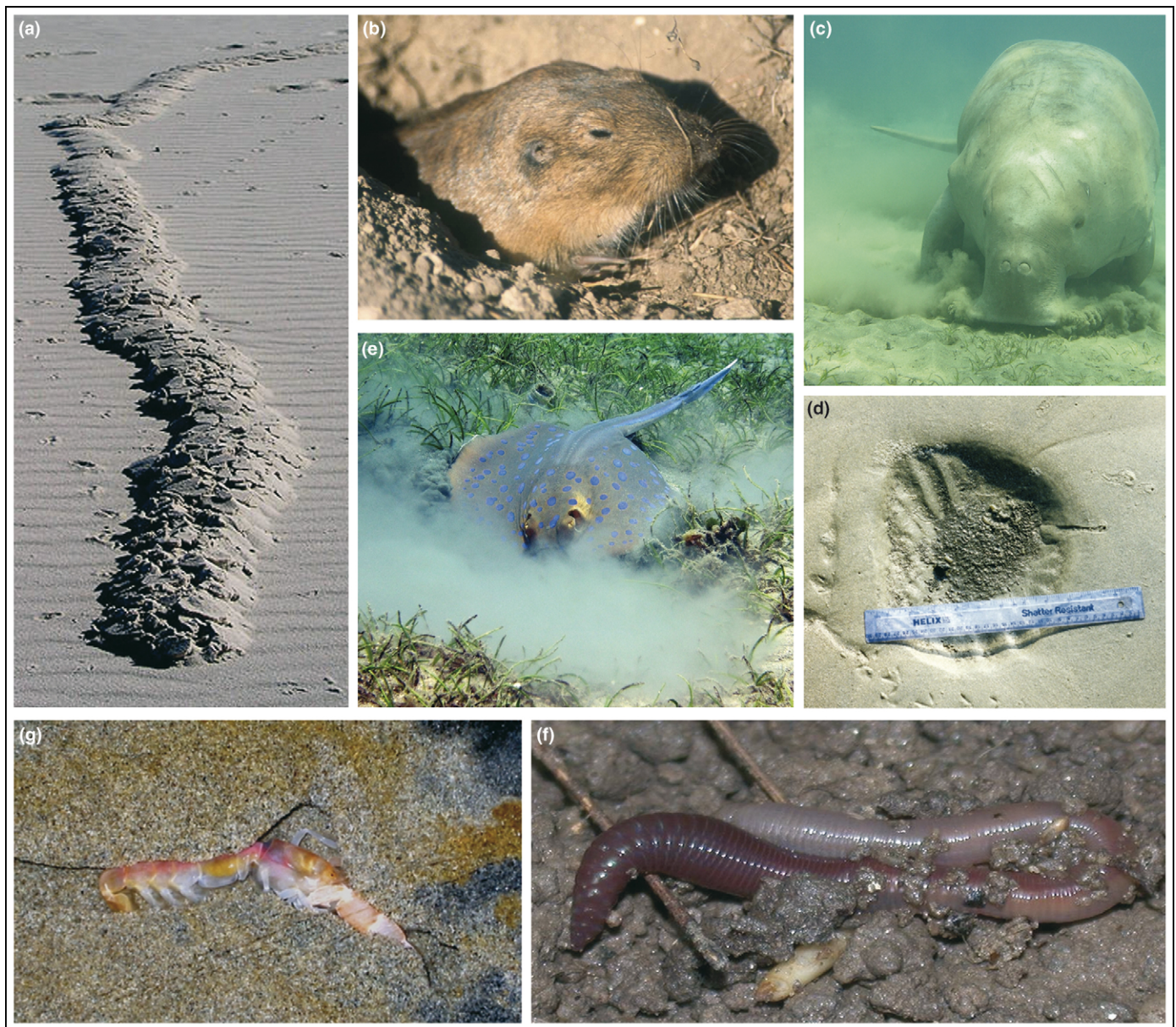
Figure 1. Bioturbation results from a range of animal activities. The most eye-catching are those created by larger subterranean mammals [13], such as insectivorous moles [(a) mole track at Noordhoek beach, Cape Town] and herbivorous pocket gophers Thomomys talpoides macrotis (b) in prairie grasslands. In the marine environment, large-scale burrowing is also present, but less easily detectable [7]. Side-scan sonar has revealed conspicuous trenches (4-m long, by 2-m wide, by 0.4-m deep) created by grey whales in search of benthic amphipods, and long linear traces (0.4-m deep by 50-m long) generated by walrus ploughing the surface sediment in search for bivalves. In seagrass meadows, similar-sized pits and trails are created by herbivores, such as geese and dugong Dugong dugong (c) feeding on rhizomes. On tidal flats, smaller feeding pits (d) (up to 1-m wide and 30-cm deep) are attributed to stingrays such as the blue-spotted stingray Taeniura lymma (e). Small invertebrates have a small per capita impact, but are dominant from a global perspective because of their sheer abundance and ubiquity [7]; examples include ants, termites and the common earthworm Lumbricus terrestris (f). In the marine environment, the predominant bioturbators are deposit-feeding polychaetes and various burrowing crustaceans, such as burrowing shrimp [(g) geochemical gradients created in a laboratory observatory by the shrimp Neotrypaea californiensis ]. Reproduced with permission from Robb Tarr (a), Richard Reading (b), Dick van Oevelen (c,e), Anthony D'Andrea (d,g), Cynthia Simms Parr (f).

ocean floor via pellet production, track formation and different types of construction, such as mounds and pits [17]. This biologically induced roughness modifies the hydrodynamics above the sediment layer, which in turn affects erosion and resuspension [8]. In addition, active sediment transport could also operate, as suspension feeders capture food particles from the water column (biodeposition) or deposit feeders eject fluidised faecal pellets into the water column (bioresuspension) [18]. Even in coastal systems, which are traditionally seen as shaped only by the physical forces of currents and waves, hydraulic engineers have recently recognised